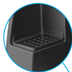
Rear steps provide user-friendly step-up assistance